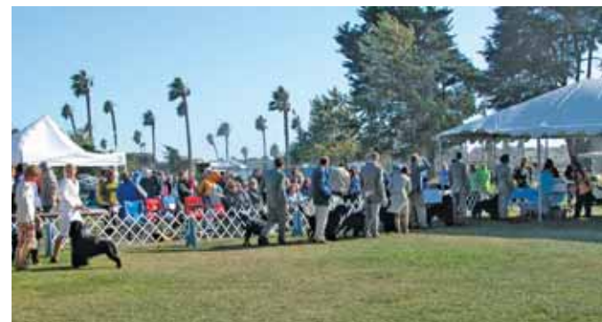
Left: Handing out Awards of Merit. The final day took place in gale force winds, see the trees and tent!